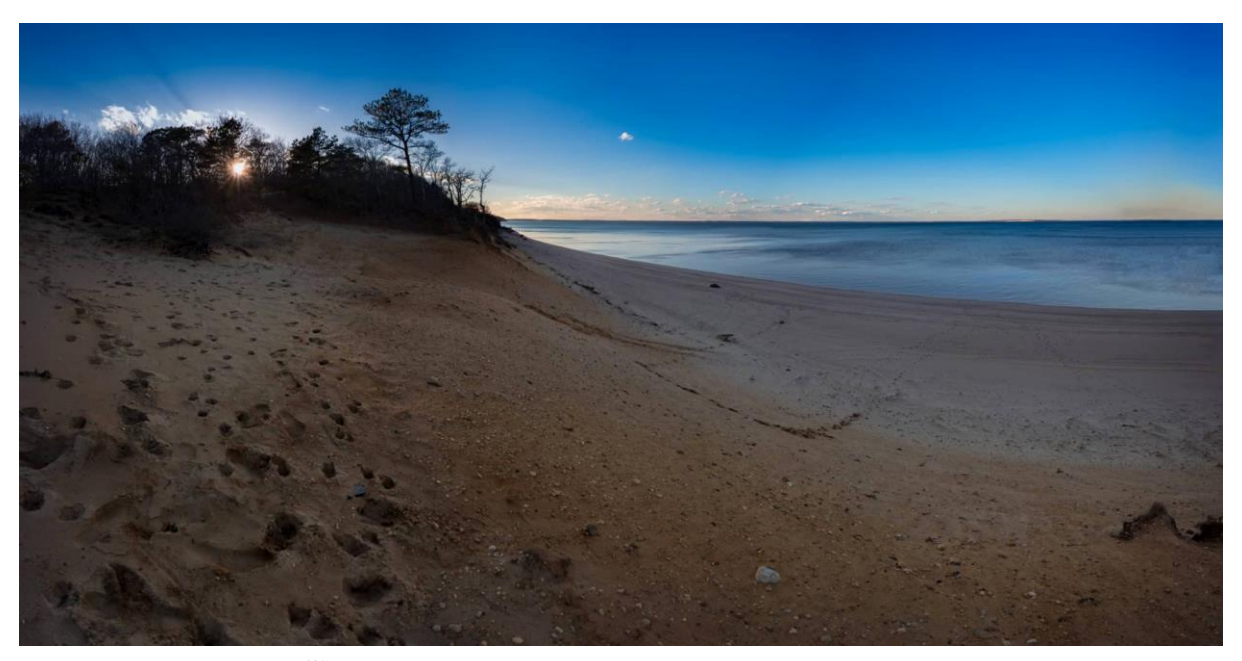
Above: West Woods Site - part of the On this Site project.

<u>FC</u>: Looking at your work, there is a sense that you are treating landscape and identity as interwoven entities; or at the very least, suggesting that one greatly impacts the other. How important do you think our relationships to place and environment are?