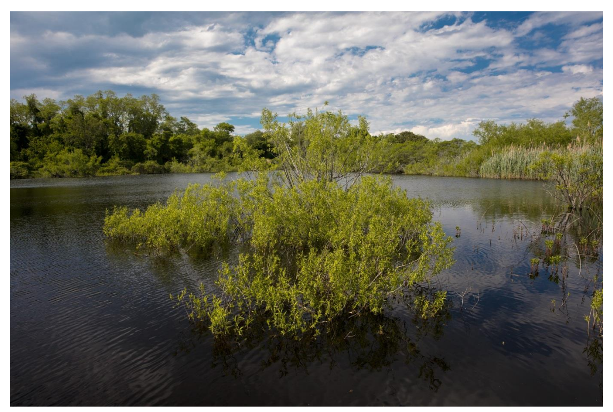
Above: Lily Pond Site - part of the On this Site project.