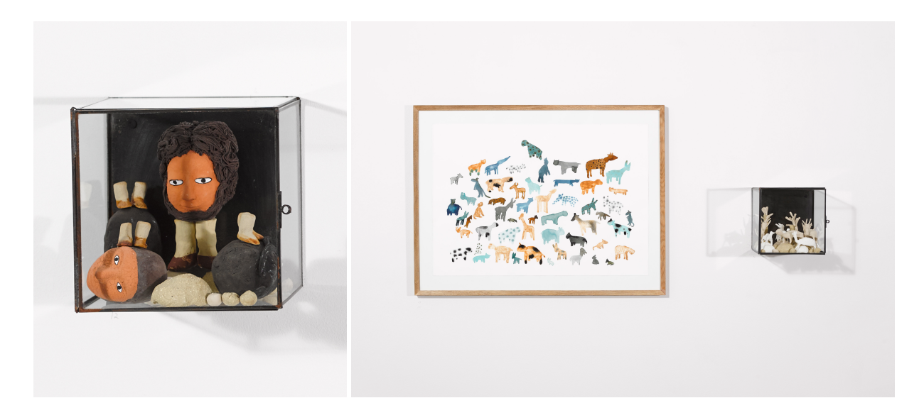
Above: I Shall Change the Way Things are Ordered, 2018. Exhibition featuring figurines made using clay sourced from Soria, Girona and Sevilla, Spain, and works on paper. Kevin Kavanagh Gallery, Dublin.

In the current political situation that Catalunya is going through, and as a Catalan person, I was particularly interested to move around to different areas of Spain. It was actually very complicated, and I had many conversations about the situation. Not always pleasant.