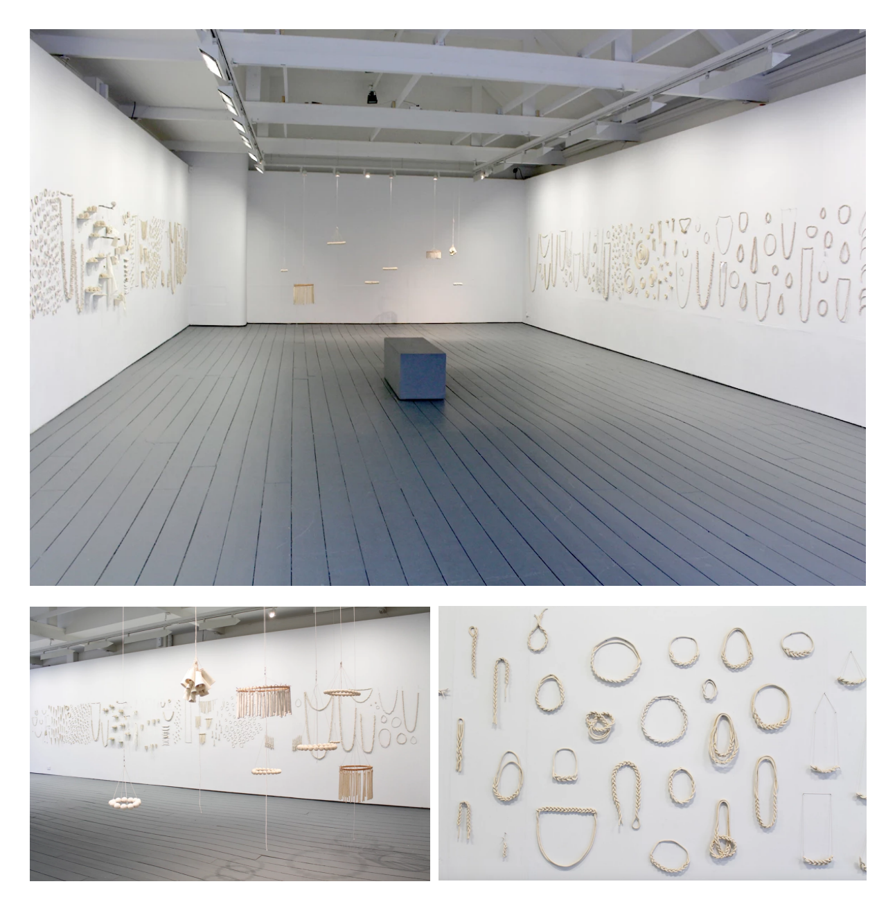
Above: eye before e except after see , 2015. Installation using different types of clay, porcelain, wood and string. Limerick City Gallery.

Some time ago, I came to the conclusion that the experience of life is much more pleasurable—and makes much more sense—if it is shared with other humans.