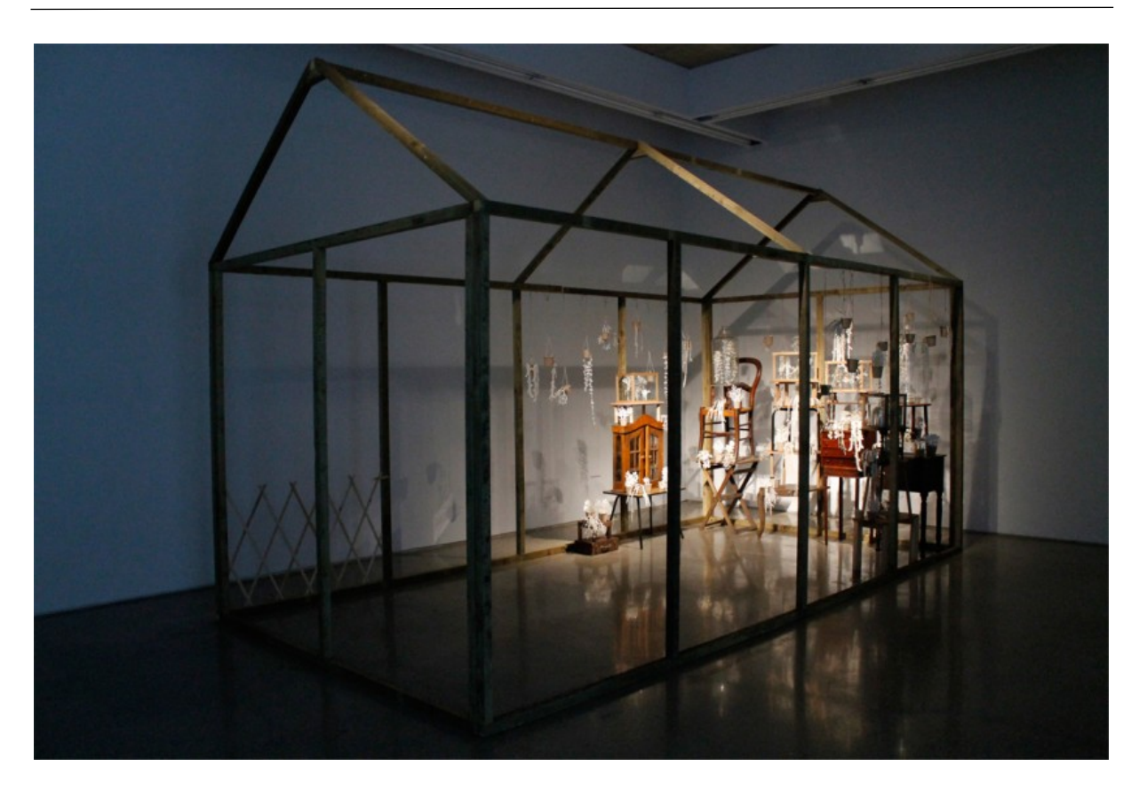
Above: Greenhouse (from, a painful excess of pleasure ), 2013. Installation using wood, paper and glass. Kevin Kavanagh Gallery, Dublin.