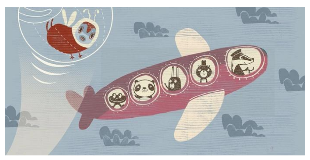
Illustration from Bounce Bounce © Brian Fitzgerald, 2014

Centring the narrative around characters other than humans adds to the appeal of this visual narrative for young readers but may also lends itself to creating a safe distance for any who may have experienced involuntary travel and forced displacement. The alien bounces from page to page (and from one new experience to another) in its protective balloon stimulating the reader's curiosity to turn over the page and see what it will encounter next. In direct contrast to Tan's The Arrival , in Fitzgerald's book it is the protagonist more so than the environment that represents the unfamiliar. Yet, from this inverted perspective of an alien in the reader's familiar environment, here again the reader is encouraged to empathise and imagine what it must be like for a stranger to suddenly experience cultural dislocation, trying to make sense of the unknown. The little alien's sometimes perplexed, at other times surprised, reactions suggest a certain level of vulnerability and bewilderment in this regard. However, despite the forced departure from home and encounters with perceived perils, Bounce Bounce ends with a positive and important message which highlights the traveller's resilience - when the alien's protective balloon finally bursts, it finds that exposure to unfamiliar things and real engagement with his new environment can be a source of delight and wonder rather than a threat.