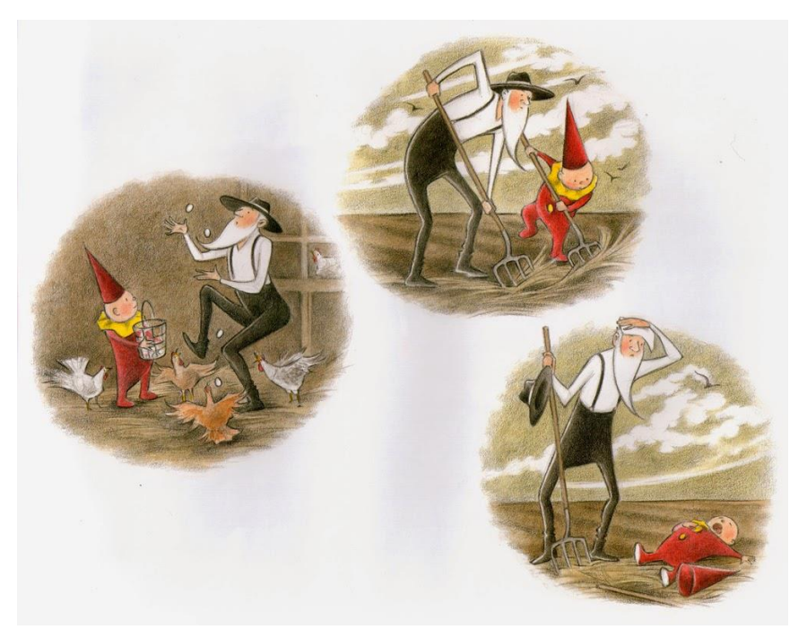
Illustration from The Farmer and the Clown © Marla Frazee, 2014

The story suggests that if we are open in our encounters with others (and Otherness), we have much to learn from one another. Certainly, in this charming visual narrative it is clear that the farmer and clown greatly enjoy each other's company and the young clown's evident joy in being reunited with his own people is tinged with sadness at having to move on and say goodbye. It is also a reassuring tale about the compassion and kindness of strangers as well as the importance of family and friendships.