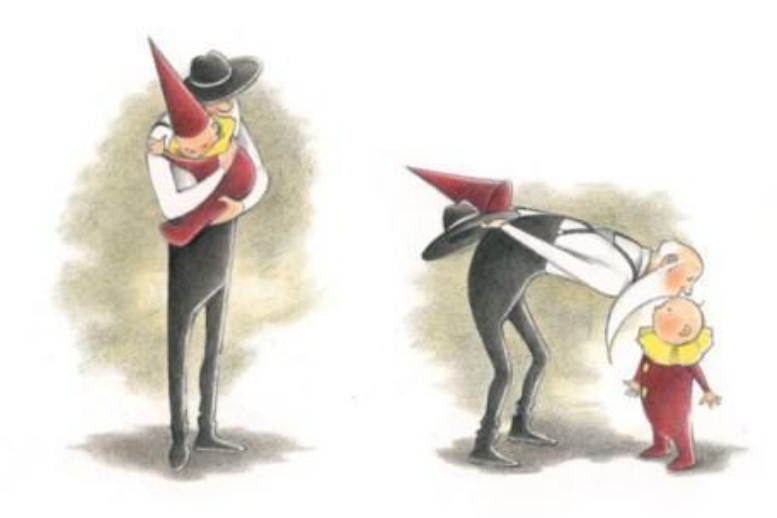
Illustration from The Farmer and the Clown \ensuremath{\mathbb{O}} Marla Frazee, 2014

The story suggests that if we are open in our encounters with others (and Otherness), we have much to learn from one another. Certainly, in this charming visual narrative it is clear that the farmer and clown greatly enjoy each other's company and the young clown's evident joy in being reunited with his own people is tinged with sadness at having to move on and say goodbye. It is also a reassuring tale about the compassion and kindness of strangers as well as the importance of family and friendships.