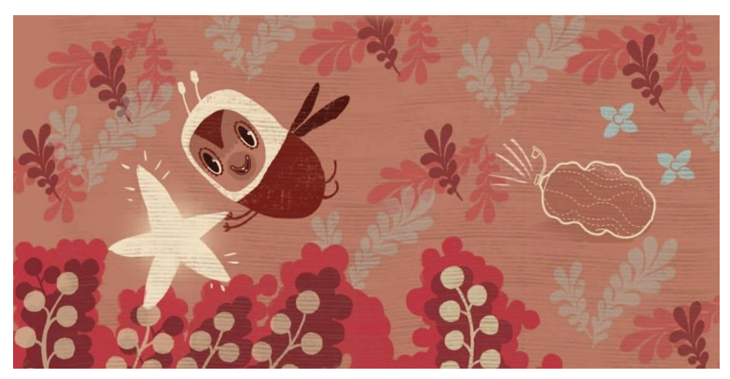
Illustration from Bounce Bounce © Brian Fitzgerald, 2014

Centring the narrative around characters other than humans adds to the appeal of this visual narrative for young readers but may also lends itself to creating a safe distance for any who may have experienced involuntary travel and forced displacement. The alien bounces from page to page (and from one new experience to another) in its protective balloon stimulating the reader's curiosity to turn over the page and see what it will encounter next. In direct contrast to Tan's The Arrival , in Fitzgerald's book it is the protagonist more so than the environment that represents the unfamiliar. Yet, from this inverted perspective of an alien in the reader's familiar environment, here again the reader is encouraged to empathise and imagine what it must be like for a stranger to suddenly experience cultural dislocation, trying to make sense of the unknown. The little alien's sometimes perplexed, at other times surprised, reactions suggest a certain level of vulnerability and bewilderment in this regard. However, despite the forced departure from home and encounters with perceived perils, Bounce Bounce ends with a positive and important message which highlights the traveller's resilience - when the alien's protective balloon finally bursts, it finds that exposure to unfamiliar things and real engagement with his new environment can be a source of delight and wonder rather than a threat.