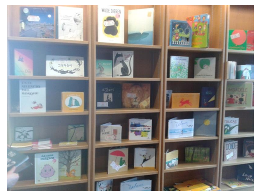
Silent Books Exhibition, dlr LexIcon, 8 May 2017

The exhibition was an absolute gift...For many of the children, the diverse range of books on display proved enormously exciting as many of the illustrators would not be familiar to Irish audiences. Horizons were expanded.<sup>32</sup>