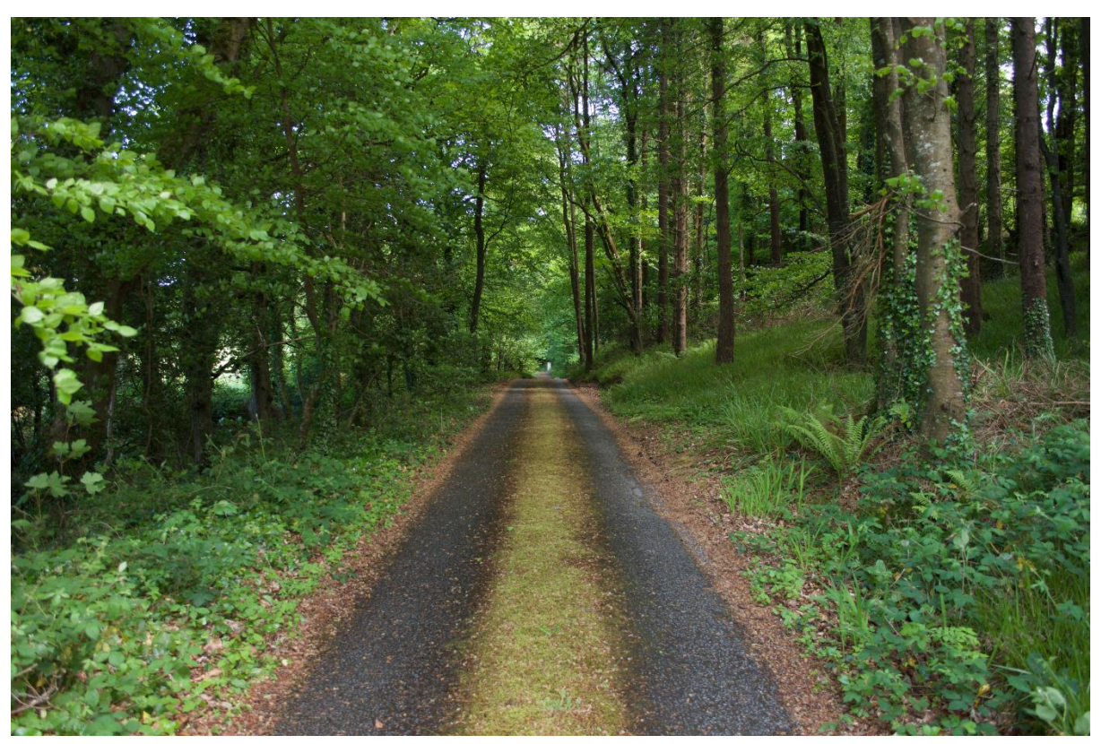
Mount Trenchard Direct Provision Centre, Foynes