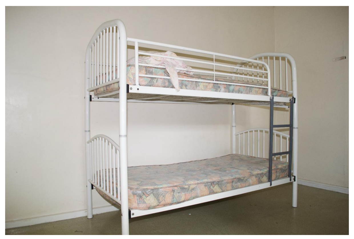
Kilmacud House Direct Provision Centre, Dublin