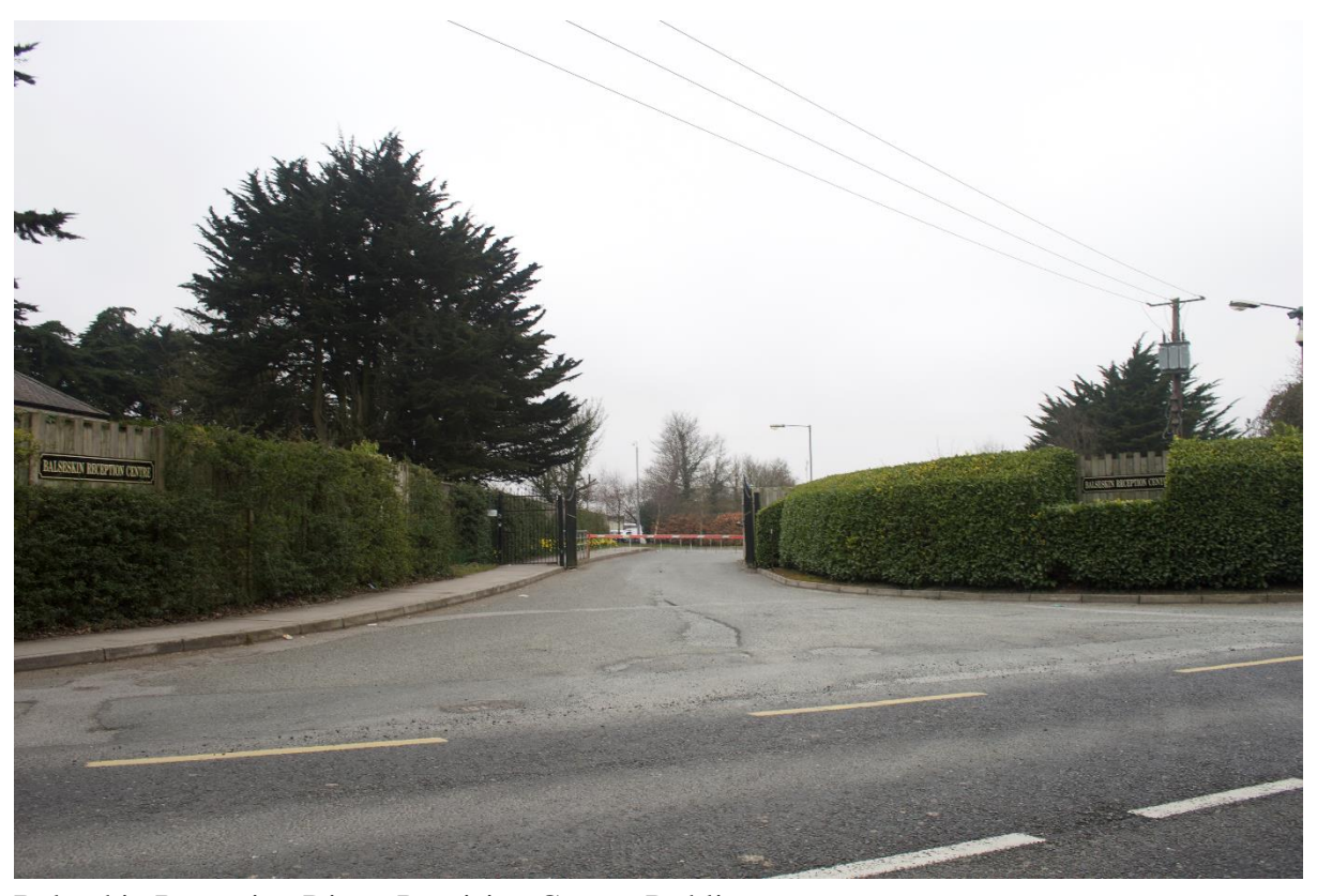
Balseskin Reception Direct Provision Centre, Dublin