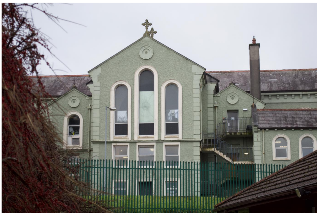
Globe House Direct Provision Centre, Sligo