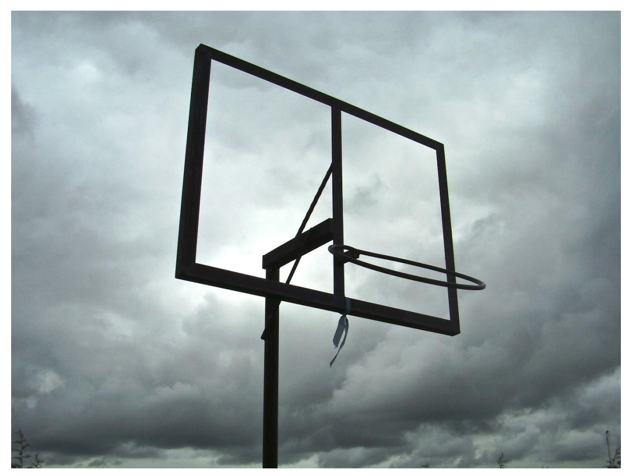
The Old Convent Direct Provision Centre, Ballyhaunis