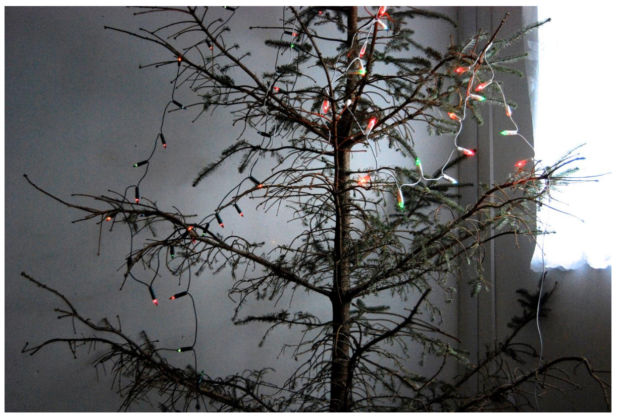
The Old Convent Direct Provision Centre, Ballyhaunis