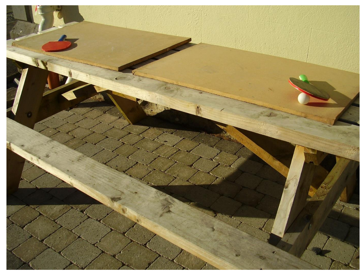
The Old Convent Direct Provision Centre, Ballyhaunis