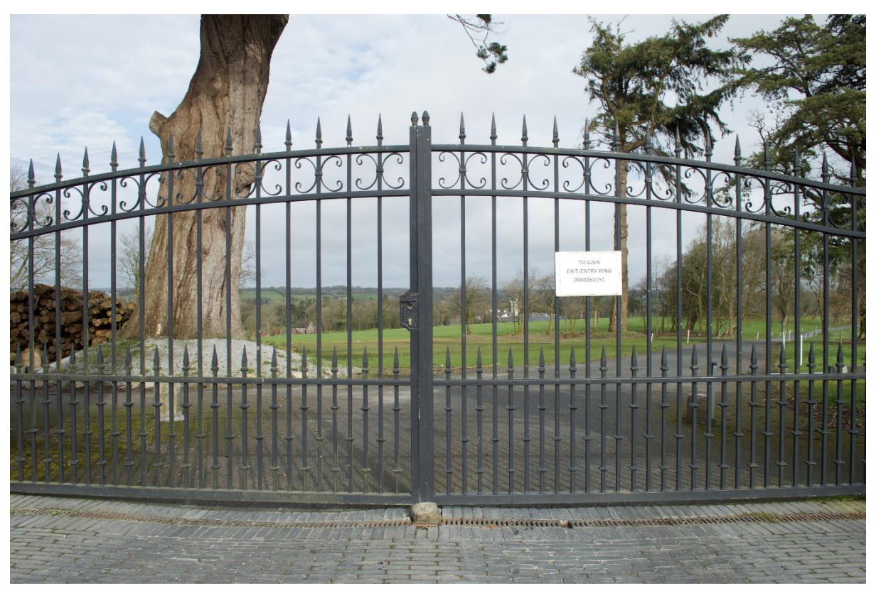
Drishane Castle Direct Provision Centre, Cork