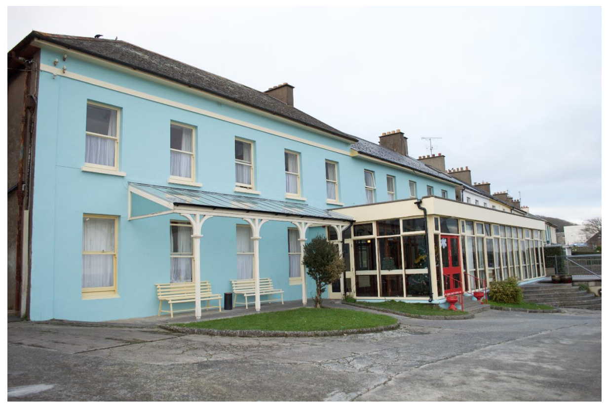
Atlantic View Direct Provision Centre, Tramore