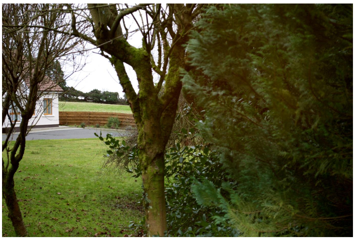
Beechlawn Direct Provision Centre, Wicklow