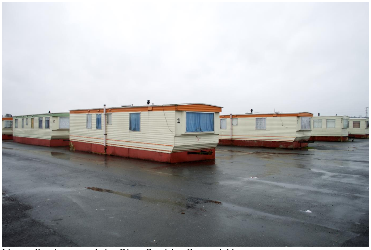
Lissywollen Accommodation Direct Provision Centre, Athlone