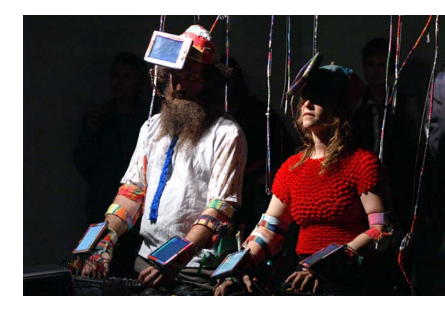
VIDEO WEAR, 2003. LOVID.

REBECCA: There are a lot of definitions of noise and it is a term that means very different things in a lot of the disciplines we are working across.